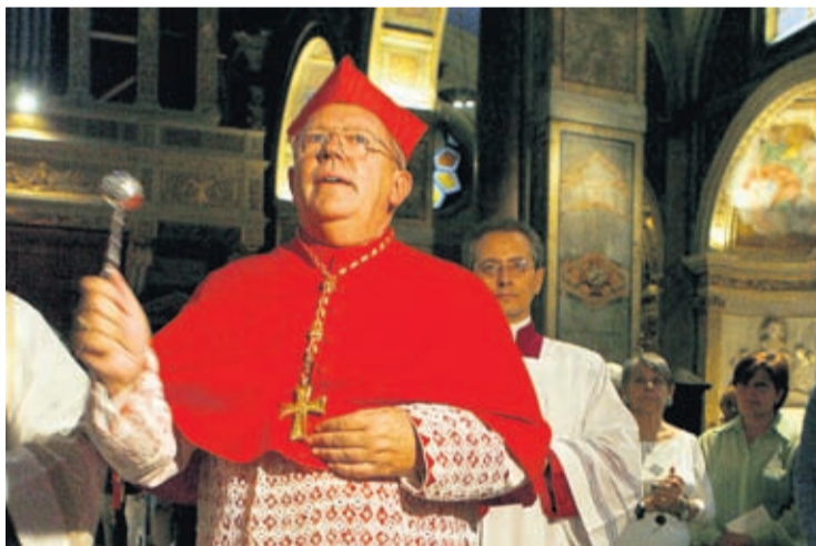
Archbishop of Bordeaux, France, Cardinal Jean-Pierre Bernard Ricard blesses his titular church - Sant' Agostino - during a ceremony to officially take possession of his church, in Rome, Sunday, Oct. 8, 2006. Cardinal Jean-Pierre Ricard said on Monday Nov. 7, 2022 that he had abused a 14-year-old girl thirty-five years ago and is withdrawing from his functions. The move comes after a report issued last year revealed a large number of child sex abuse cases within the country's Catholic Church.

PARIS (AP) — Cardinal Jean-Pierre Ricard, one of France's highest-ranking prelates of the Catholic Church, said Monday that he had abused a 14-year-old girl 35 years ago and is withdrawing from his religious duties. The move comes after a report issued last year revealed a